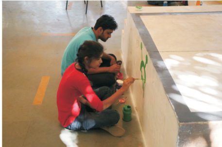
Being creative is in the blood of ISCians