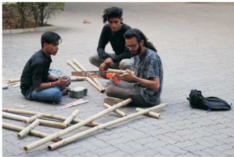
The learning and growing stage