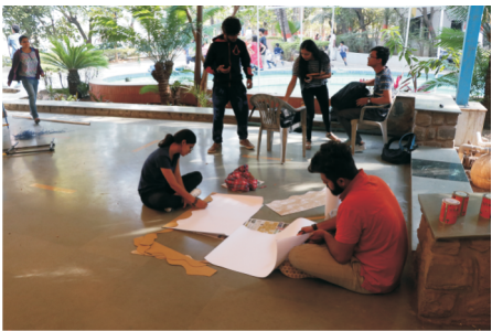
The creative deco team