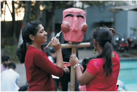
The Set Team engrossed in making puppets