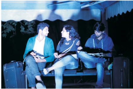
The light game