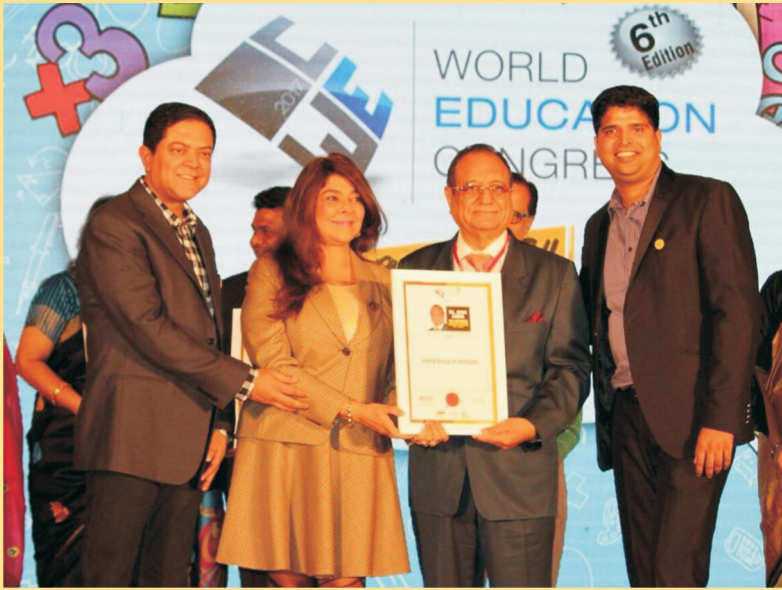
IGI receives an award at The World Education Congress