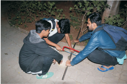
The late night dedication