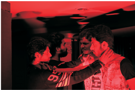
ISC's expressive actors