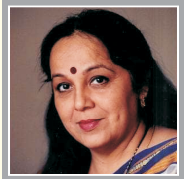
Chief Guest, Rohini Hattangadi