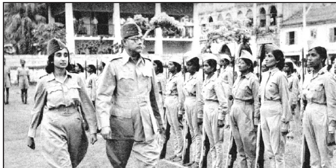
Netaji with Lakshmi Sehgal and other women cadets.

Netaji Subhash Chandra Bose was one of the most renowned and dynamic personalities of the pre-independence Indian politics. He dominated Indian politics for more than two